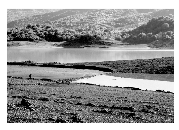
Figure 2: Participant describes how the black and white filter helped him show the roughness of the landscape.

Sometimes these fun and unique looks are not imagined by the photographer or not intended until when the filter is applied: